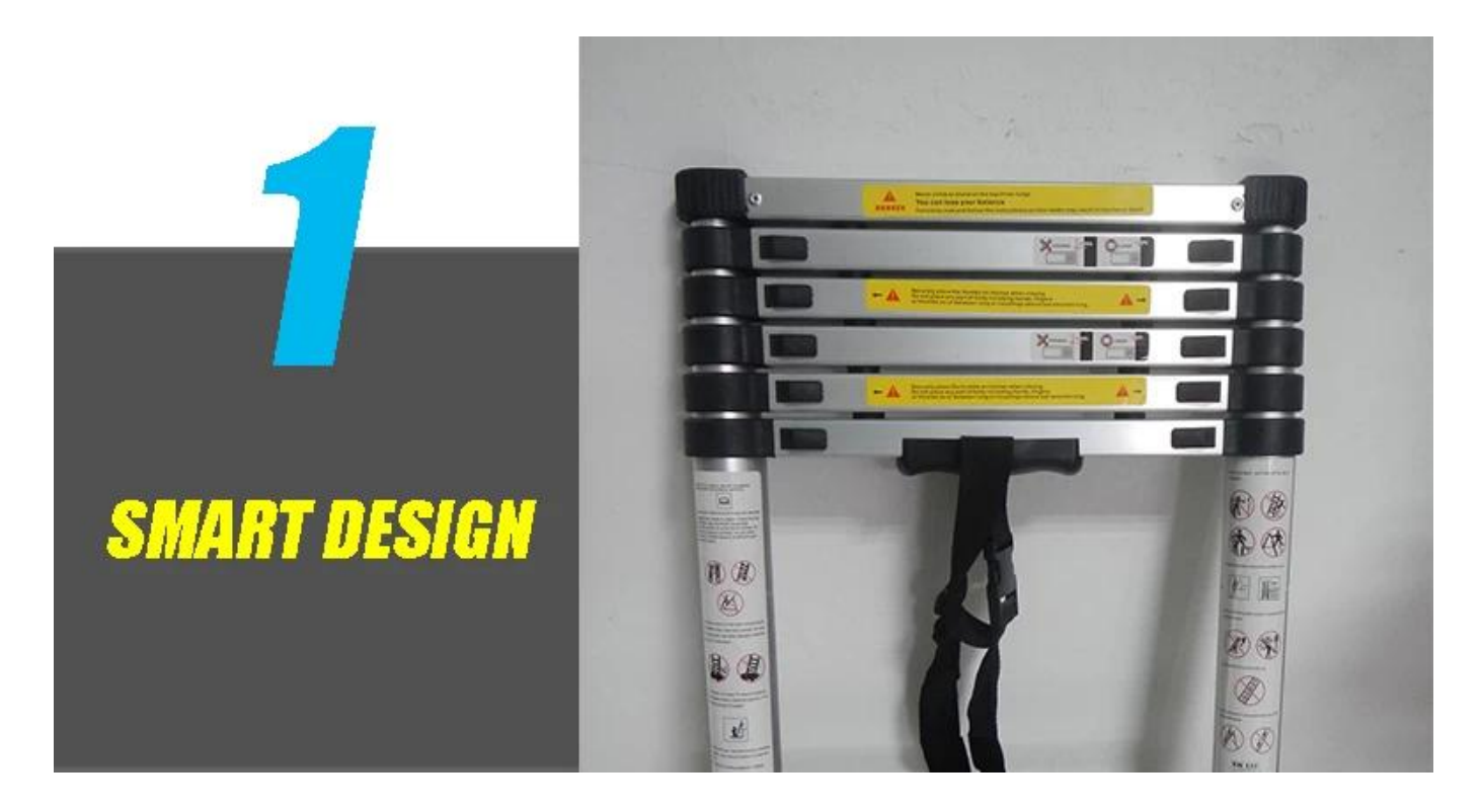
High strength nylon fasteners