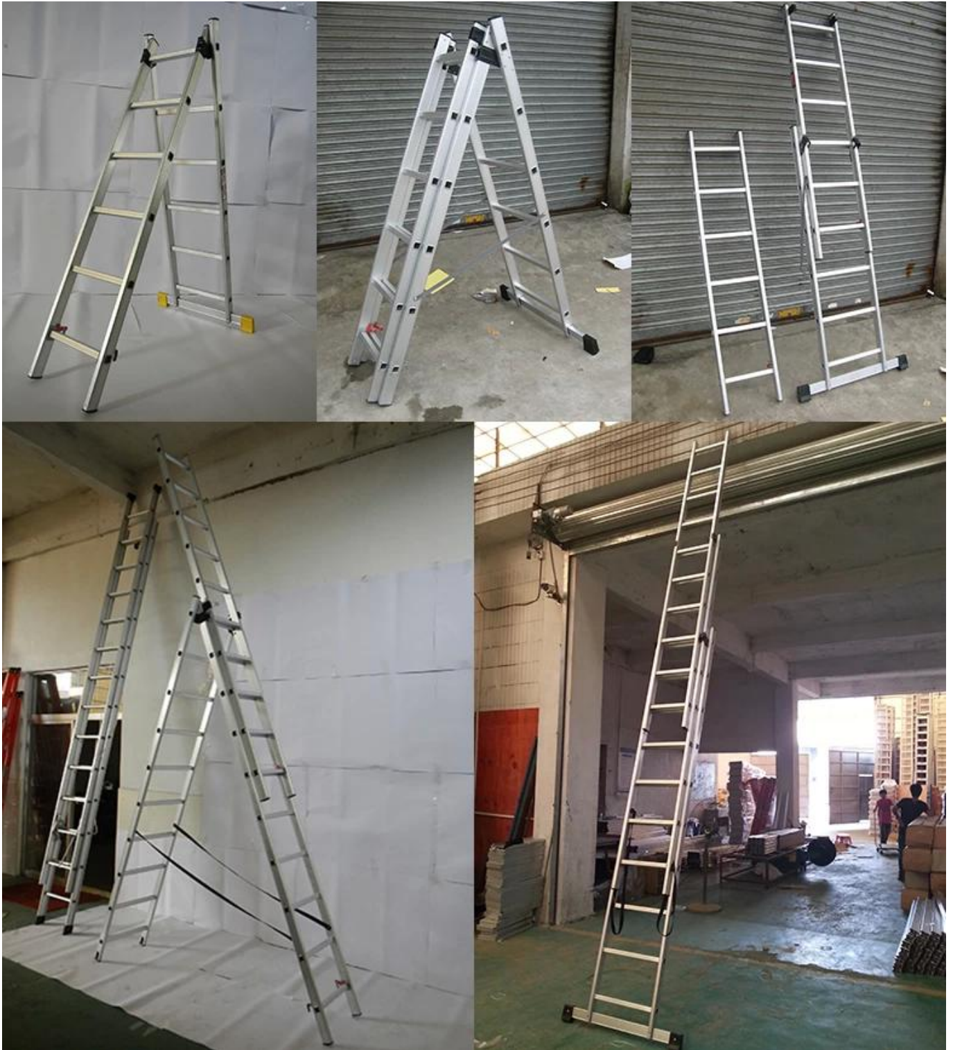
Heavy gauge steel bracket engages steel pin to lock section in step ladder position