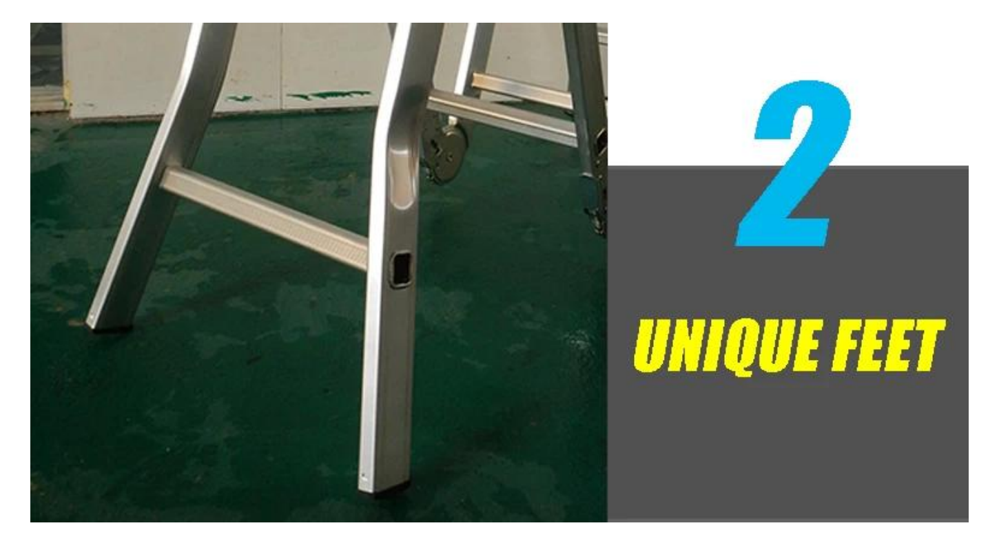
With 2 panels you can stand on the ladder more stable and safety